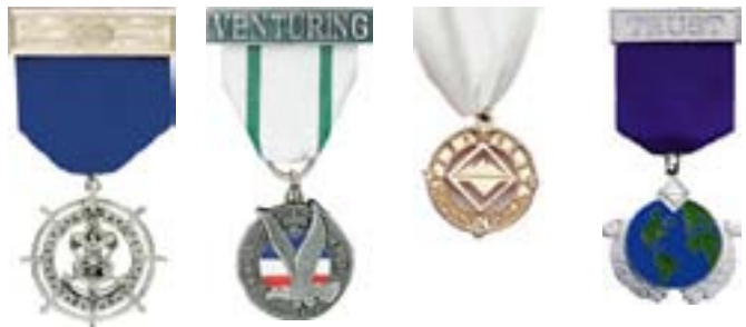
SEA SCOUTS - QUARTERMASTER AWARD